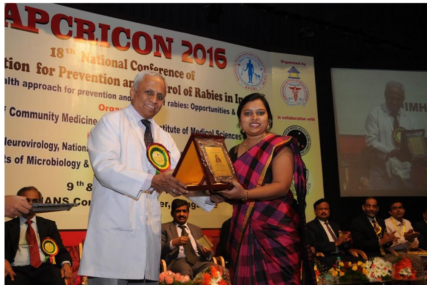
Young Scientist Award_2016